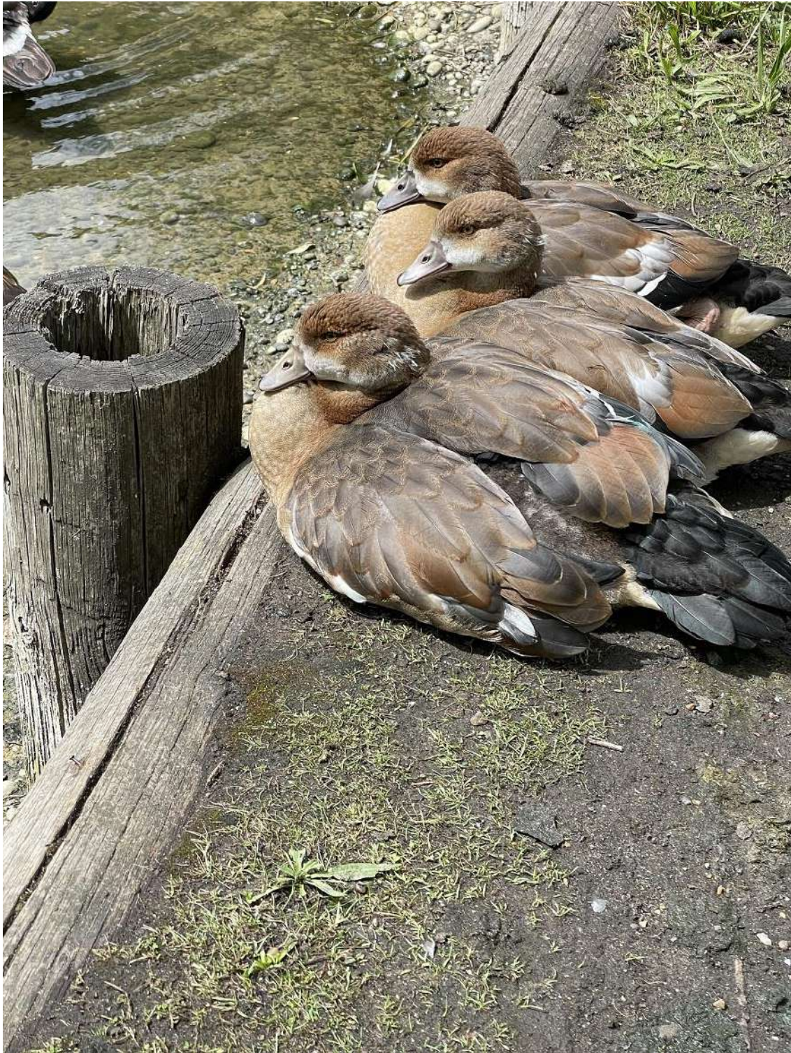
A picture of contentment. The three remaining Egyptian goslings snuggle together.