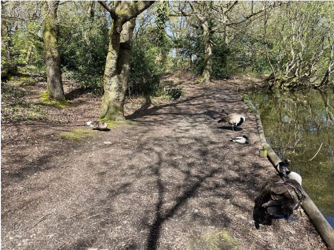
- a haven for wildlife,