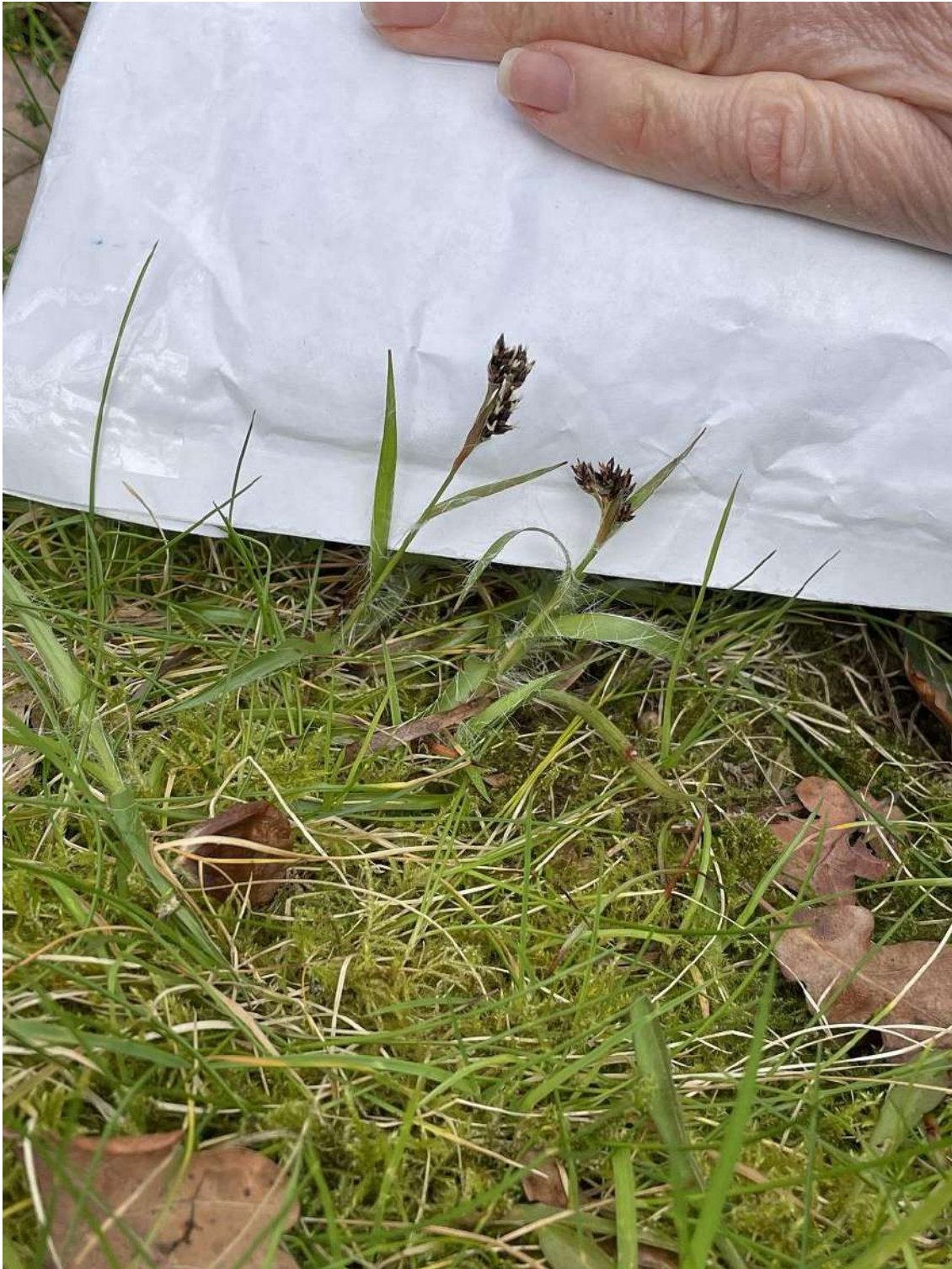
Surveying has a vital role in helping to improve biodiversity. This woodrush was identified on a recent survey of the grassland along Prince Imperial Road.