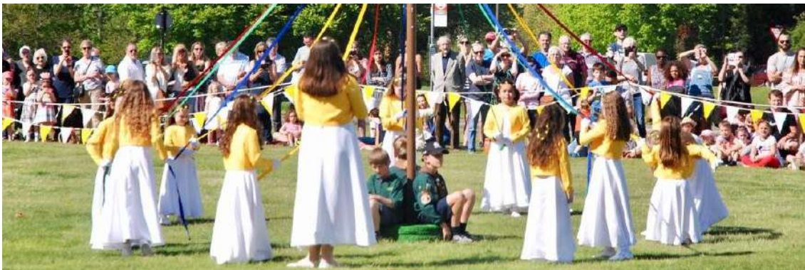
- a place for recreation and relaxation, and a site for community events, (The May Queen Ceremony is on Saturday 20 th May, and there is a full list of this year's events on the Commons at the end of this newsletter).