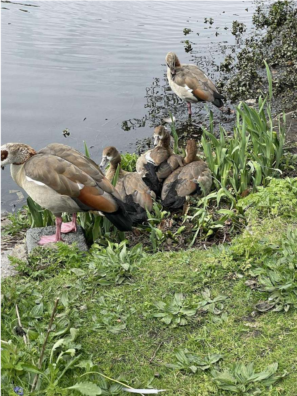
The Egyptian goslings, first seen in February, are flourishing, but the parents are still watchful.