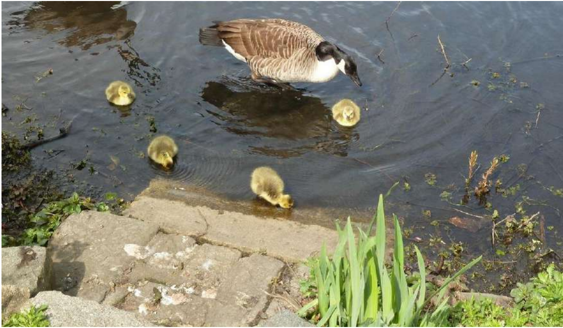
The first family of Canada geese appeared at the beginning of May.