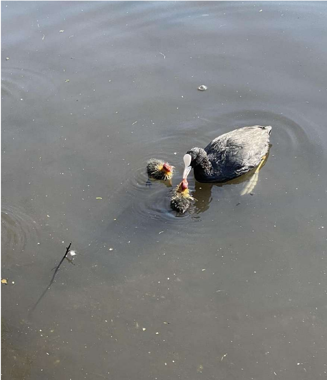
Coot babies scramble to take food from their parent's beak.