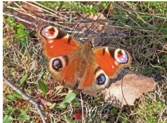
Early butterflies. You might see a comma, a brimstone, or a peacock butterfly like the one above.