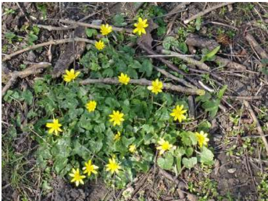
Spring flowers like this lesser celandine.