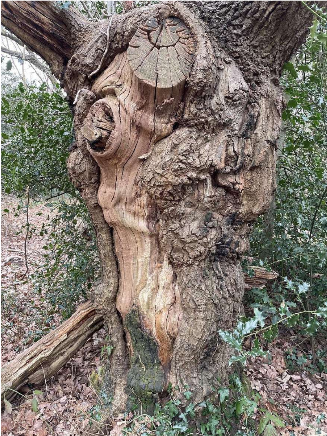
A grand old man of the Commons – what tales he could tell!